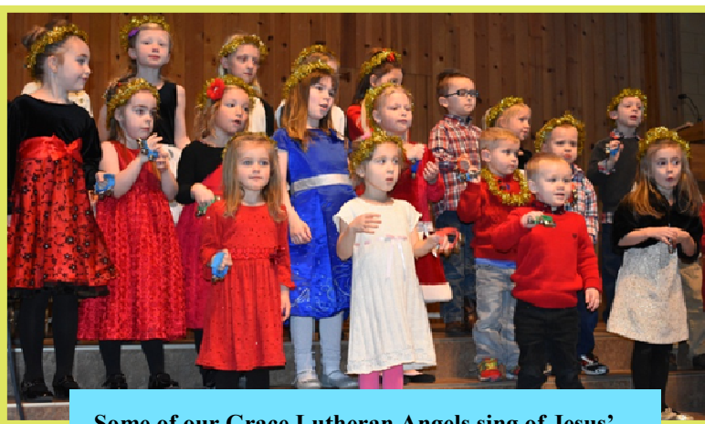
Some of our Grace Lutheran Angels sing of Jesus' birth at our Annual Christmas Program